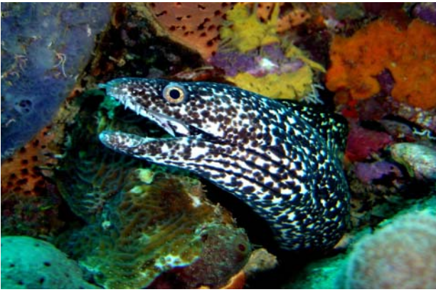
[Left] Spotted moray eel checking me out... am I edible?