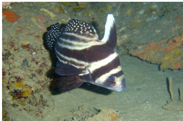
Spotted drumfish practicing his figure-8s