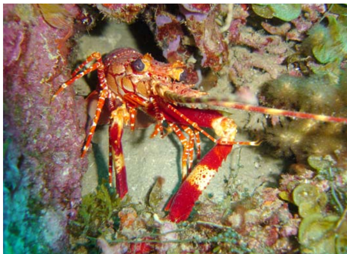
Lobsters aplenty! Several species are abundant

and Superman's Flight peppered our log-books. Dive after dive we emerged with tales of octopus, moray eels, garden eels, harlequin eels, barracuda, lobsters, spiny lobsters, slipper lobsters, hard-shell crabs, pelagic crabs, decorator crabs, hermit crabs, arrow crabs, feather dusters, fire worms, Christmas tree worms, fan worms, mantis shrimp, coral-banded shrimp, pistol shrimp, drumfish, peacock flounders, lizardfish, stonefishes of various sort, 4 or 5 species of damselfish, butterfly fish, rainbow trumpets, sea turtles, parrotfish, puffers, grunts, snapper, and the elusive St. Lucia seahorse. I'd be remiss if I didn't also mention the gobies on the vast array of stony corals and sponges. In short, St. Lucia diving is a macro photographer's dream, although the ever-present damselfish demanded some unusual and