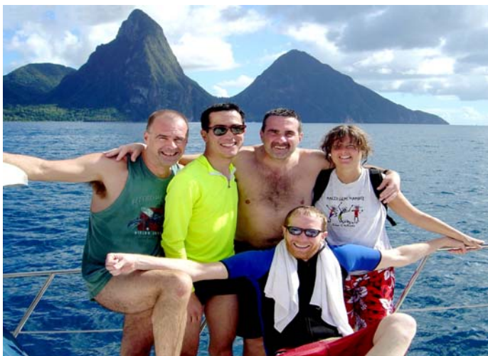
Five happy divers in front of St. Lucia's Pitons.

There were a few things about the diving that really stood out for me on this trip. First were the swarms of huge schools of small fish. Second was the absence of large fish. This is the first week of diving where I've not seen even one shark, ray, or even a mildly big fish. Third were the private inshore traps that the DM warned us not to touch no matter what. And finally was the overabundance of small critters crawling the reefs in open daylight. Never have I seen a