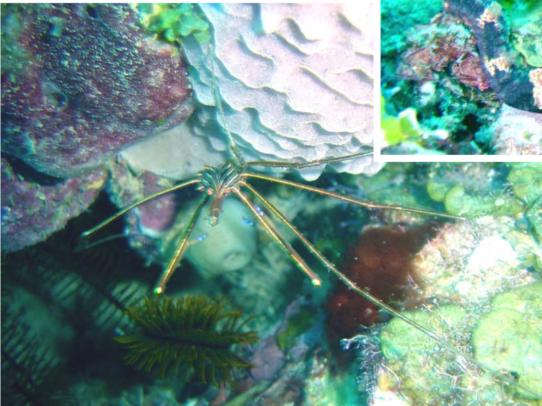
[Left] Arrow crabs are plentiful, lurking in crannies