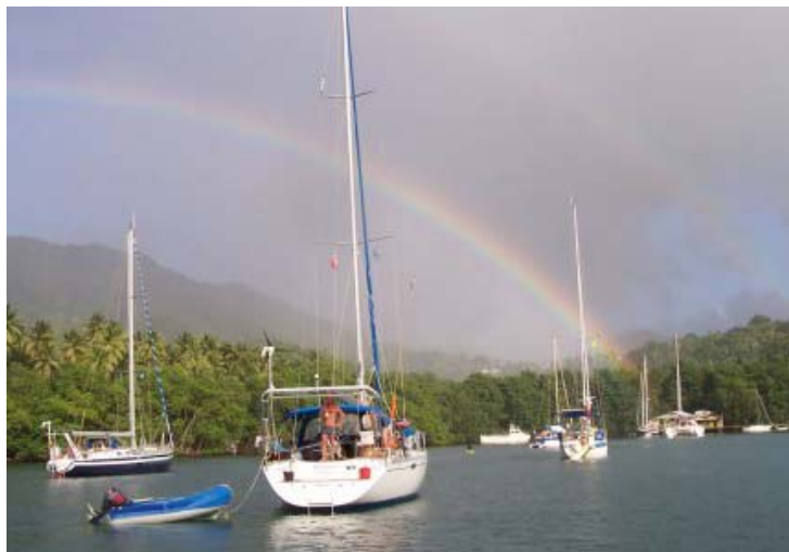
The harbor in St. Lucia.