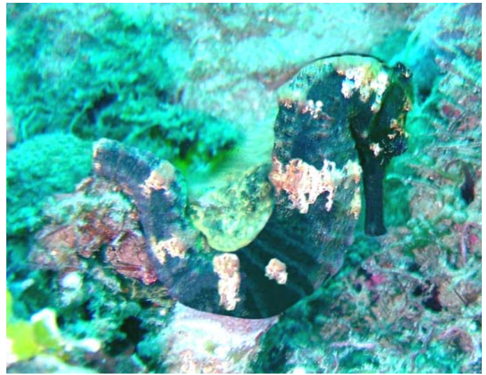
[Above] St. Lucia seahorse, sighted near the base of the Pitons.