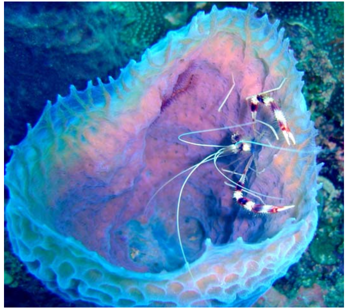
[Above] Coral-banded shrimp at a cleaning station, looking for customers. [Left] Stonefish where you least expect them ...