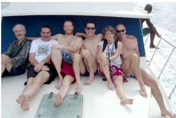
Relaxing on the bow of the Dive Fair Helen