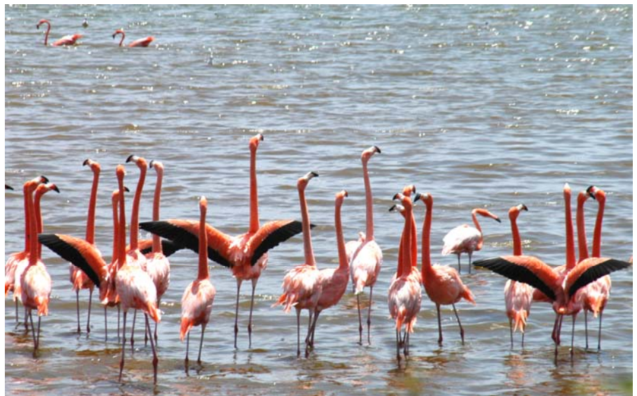
Bonaire flamingos galore!