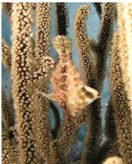
Patience and a good eye are often rewarded with sightings of captivating macro life, such as this tiny baby filefish and Curacao seahorse