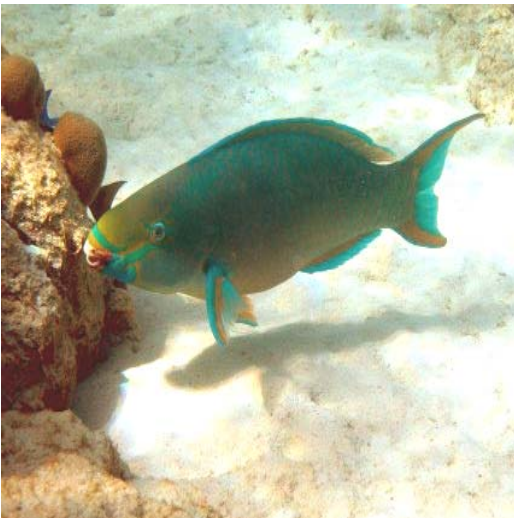
Queen parrotfish munching on the reef. Tasty!

so-token male, to the local grocery and "resort dining" – a much more affordable way of eating on the island than at most of the downtown restaurants.