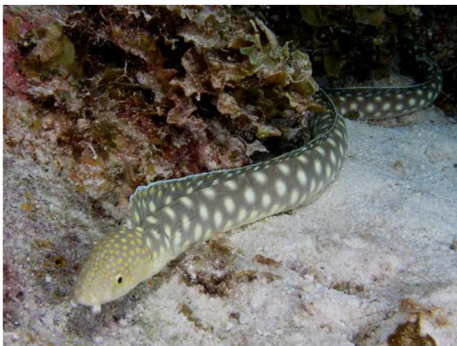
Bright yellow and white markings make this snake eel easy to spot on the Curacao reef

a day. Other more "social" divers rose late, pale and smiling, relegating their diving to the house reef much later in the day, skipping the rock-and-roll rides of the small dive craft.