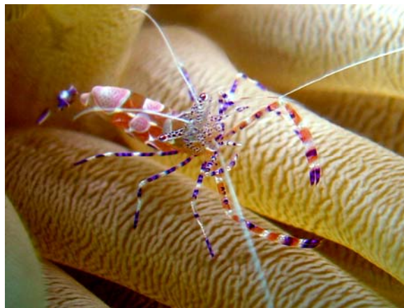
An anemone shrimp ventures out onto the arms of its host

For me, diving with my NCRD friends is like dancing, and we quickly adapted to a diving rhythm that is just ...sublime. A mix of amazing photographers and not, those with “the eye” ... finding the ever elusive octopus, the teeny tiny juvenile trunkfish ... where is the head on that giant moray under the coral? The batfish is over here! No matter what you see or where you go, I just don’t think you can find a more consistently magical dive