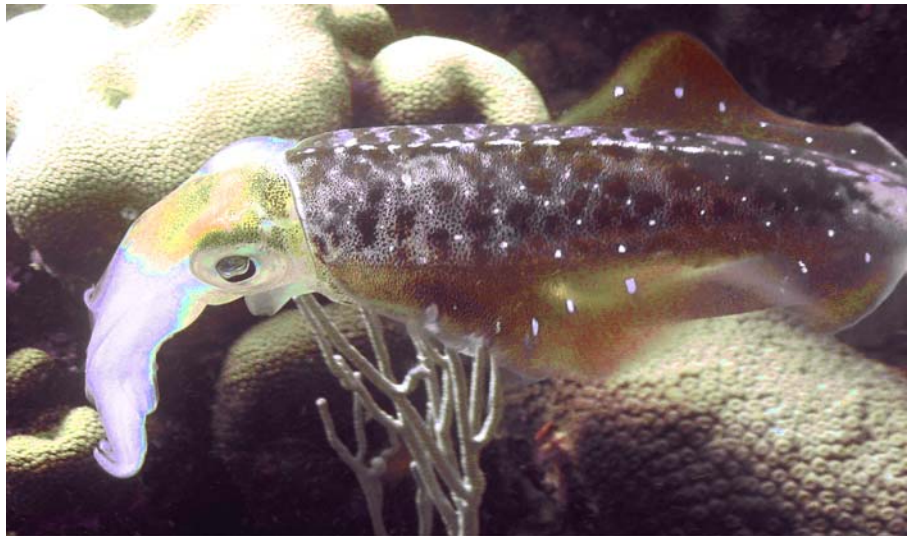
Changing colors and flashing tentacles were on display for the squid's mating dance

You may have heard it said that you haven't dove Bonaire until you've dove the Town Pier at night. I'm happy to report this as true, as that's where we had our one and only frogfish sighting of the week, it being black of course.