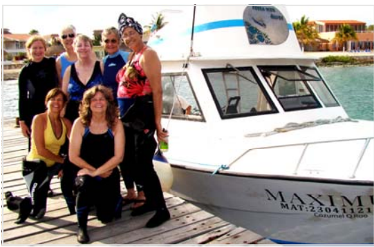
Cozumel Women's Week divers in May, 2013