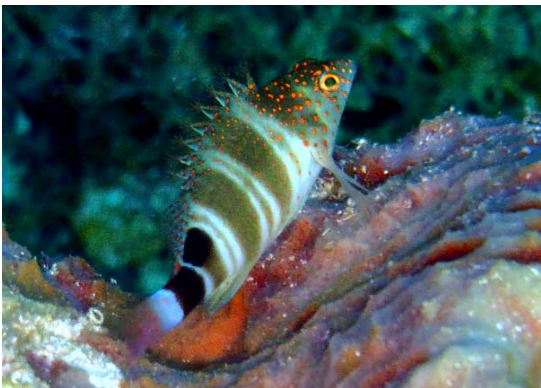
Redspotted Hawkfish in Cozumel