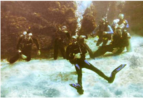
Cozumel Men's Week divers in May, 2013