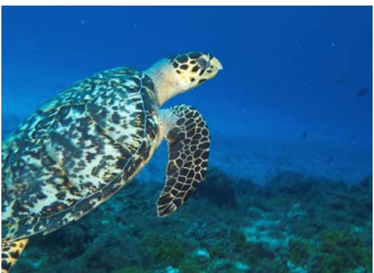
One of oh so many Cozumel turtles!