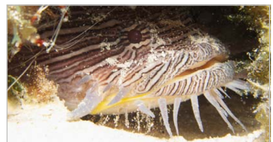
Cozumel's endemic Splendid Toadfish