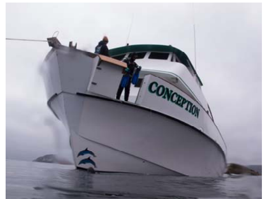
Diving on the Conception

boat we originally chartered, to Conception , a larger, better-equipped vessel. And because we did not go to San Nicolas as planned and instead visited Santa Cruz and San Miguel Islands, which are much closer, we got a rebate of the $1,070 fuel surcharge. We also ran a budget surplus on the trip because the larger boat allowed us to add a few more divers than originally planned. Bottom line is that we were able to process refunds for all attendees.